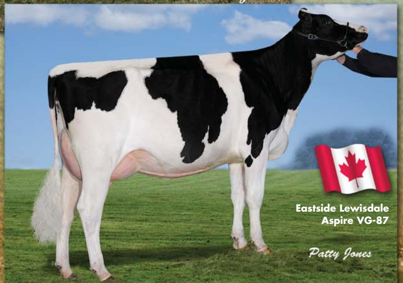
Eastside Lewisdale Aspire VG-87